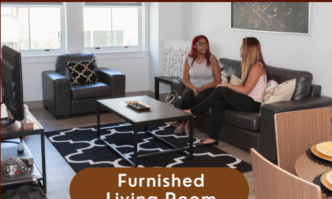
Furnished Living Room